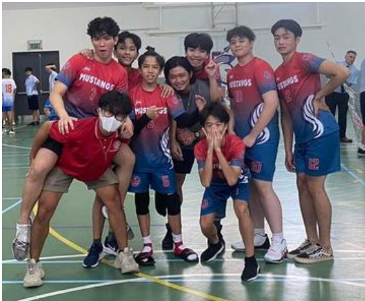
(Updated by: Angela Lai)